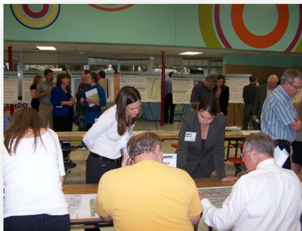
MoPac Public Engagement