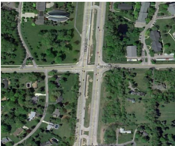
Figure 1. Median U-Turn Intersection in Bloomfield Hills, Michigan

The intersection shown in Figure 1 is near the northern end of a corridor containing numerous MUT intersections; every at-grade intersection on a 30-mile corridor of US 24, running from IH 75 in Taylor north to Orchard Lake Rd in Sylvan Lake, has been converted to a Median U-Turn configuration. At this intersection, northbound drivers on US-24 travel through the intersection with 14-Mile Road and make a U-turn at the crossover provided about 625 feet north, near the top of the figure. After making the U-turn, the now-southbound driver makes a